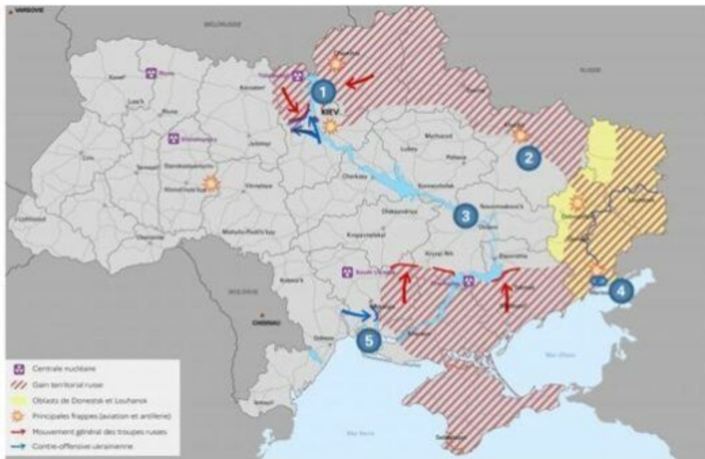
Situation Ukraine au 25 mars

... and as published by the French Ministry of the Armed Forces :