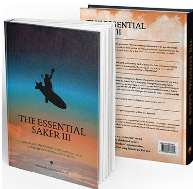
The Essential Saker III: Chronicling The Tragedy, Farce And Collapse of the Empire in the Era of Mr MAGA