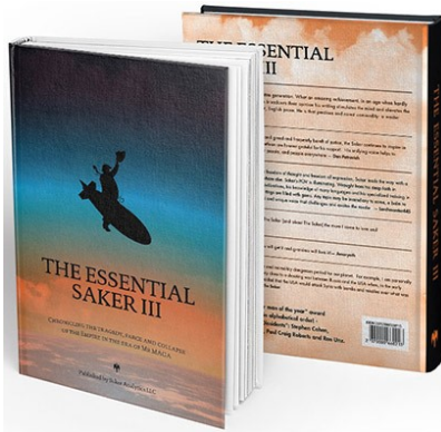
The Essential Saker III: Chronicling The Tragedy, Farce And Collapse of the Empire in the Era of Mr MAGA