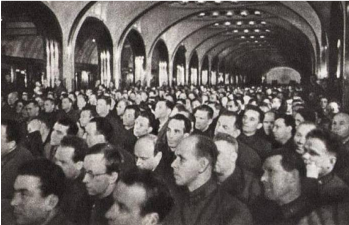
Participants of the ceremonial meeting of the Moscow City Council on November 6, 1941 listen to Stalin's speech