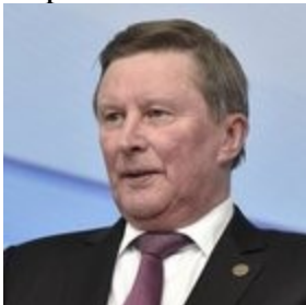
Ivanov Sergei Special Presidential Representative for Environmental Protection, Ecology and Transport.