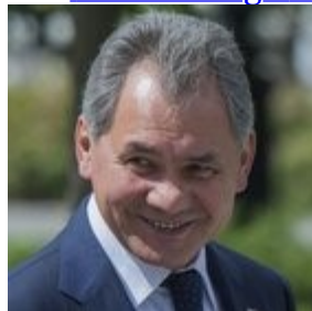
Minister Sergei Shoigu Shoigu Sergei Defence Minister, Director