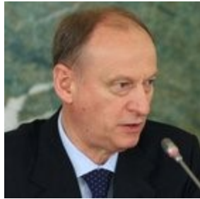
Nikolai Patrushev Patrushev Nikolai Secretary of the Russian Federation Security Council, Interior Minister Vladimir Kolokoltsev