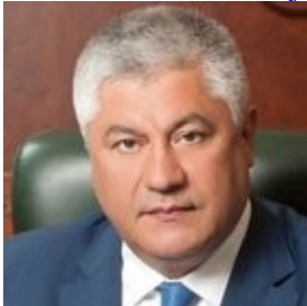
Kolokoltsev Vladimir Interior Minister, Foreign Minister Sergei