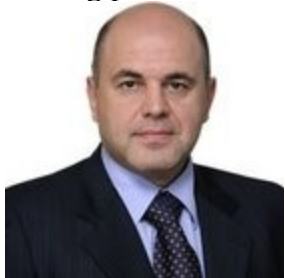
Mishustin Mikhail Prime Minister of the Russian Federation ,

Taking part in the videoconference were Prime Minister Mikhail Mishustin