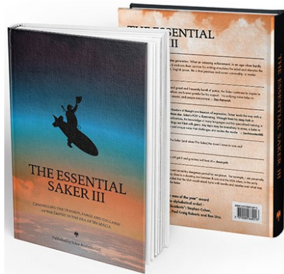
The Essential Saker III: Chronicling The Tragedy, Farce And Collapse of the Empire in the Era of Mr MAGA